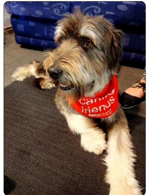
Here we have Tequila (Rottweiler), Hope (Golden Retriever) and June (Bearded Collie X) at Waikato University. These photos were sent by a student who said she was thrilled to spend time with these lovely dogs and the visit was such a great way to start the academic year.